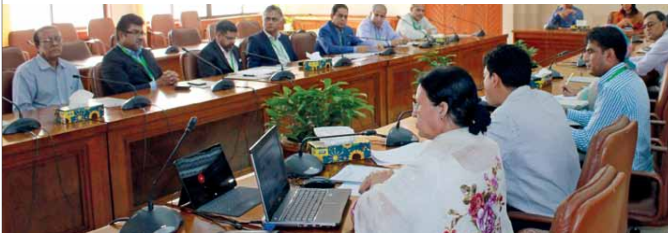
Review Meeting of Five Working Committees of BUILD at the Prime Minister's Office on September 5, 2016

BUILD features public private dialogue on five thematic areas – Tax, SMEs, Financial Sector, Trade and Investment and Sustainability and Green Growth backed by rigorous analysis and advocacy. It is supported by a strong independent secretariat that undertakes much of the analysis and advocacy to support the dialogue process, and assist in ensuring that BUILD develops specific, measurable and results-based recommendations for policy simplification. It helps the Government bring in business policy reforms thus unlock investment potentials for Bangladesh through research, dialogue and advocacy.