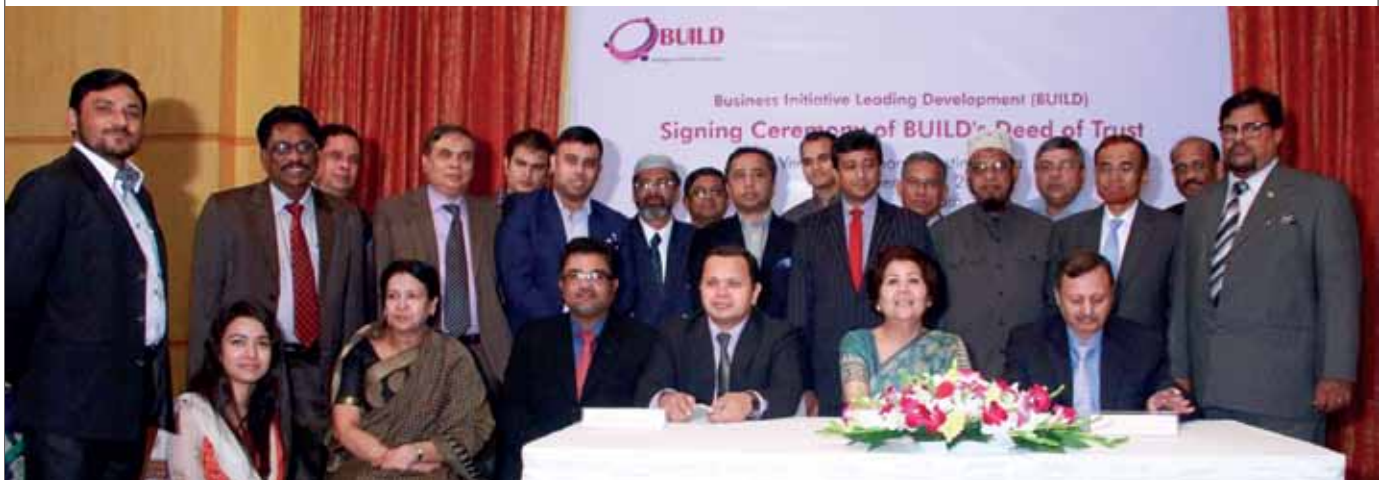
Signing of BUILD's Deed of Trust on November 3, 2013