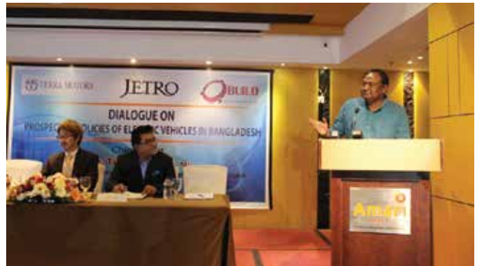
Commerce Minister Tipu Munshi speaks as the Chief Guest at a Dialogue on Prospects and Policies of Electric Vehicles in Bangladesh, organized by BUILD, JETRO and Terra Motors at Amari Dhaka, on March 13, 2019.

Commerce Minister Tipu Munshi said electric vehicles (EVs) are the future of transportation, as decarbonizing the transport sector has become a buzzword.