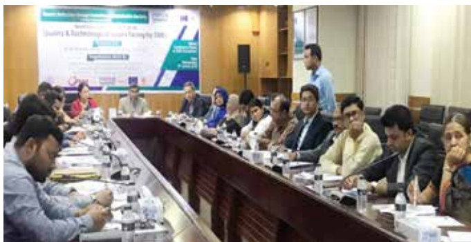
BUILD CEO speaks at the workshop at SME Foundation.

BUILD and PRISM Project organized a workshop on the Need Assessment of SME Women Entrepreneurs-Focusing on Product Quality and Technological Issues on 6th March 2019 at Conference Room of SME Foundation. As part of supporting the agenda of the SME Development Working Committee (SMEDWC) of BUILD, this assessment workshop is specifically scheduled to assess the SMEs' needs on 'Product Development-Quality and Technological Issues' pertaining to Light Engineering, Leather, Jute and Plastic Sub-sectors.