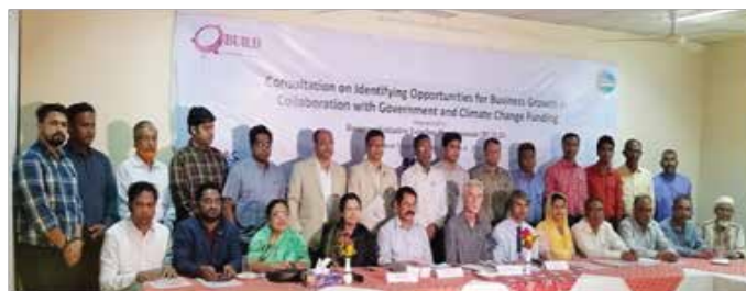
Representatives from BUILD, PROKAS, RCCI and District Level Chambers around Rajshahi Division took part at the Dialogue.

A Dialogue named "Consultation on Identifying Opportunities for Business Growth in Collaboration with Governments and Climate Change Funding" was organized at the Parjatan Motel, Rajshahi on March 24, 2019.